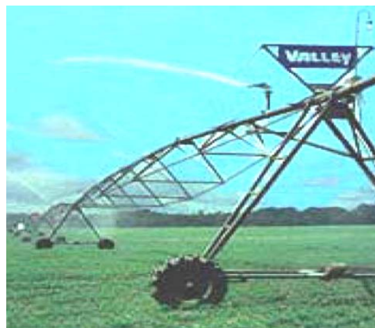
Centre Pivot Irrigator

Big gun sprinklers are capable of handling larger solids but require higher operating pressures to operate. Both the efficiency and uniformity of irrigation are low. Big gun supply lines can be underslung from conventional centre pivot systems which will allow two separate methods of irrigation – fresh and effluent.