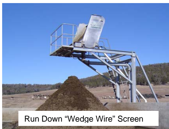
Run Down “Wedge Wire” Screen

The “Wedge Wire” screen can process between 65 and 79 cubic metres of effluent per hour (30 – 43 cubic metres for the smaller model) and produces a product at 65 – 70% dry matter. Very little maintenance is required.